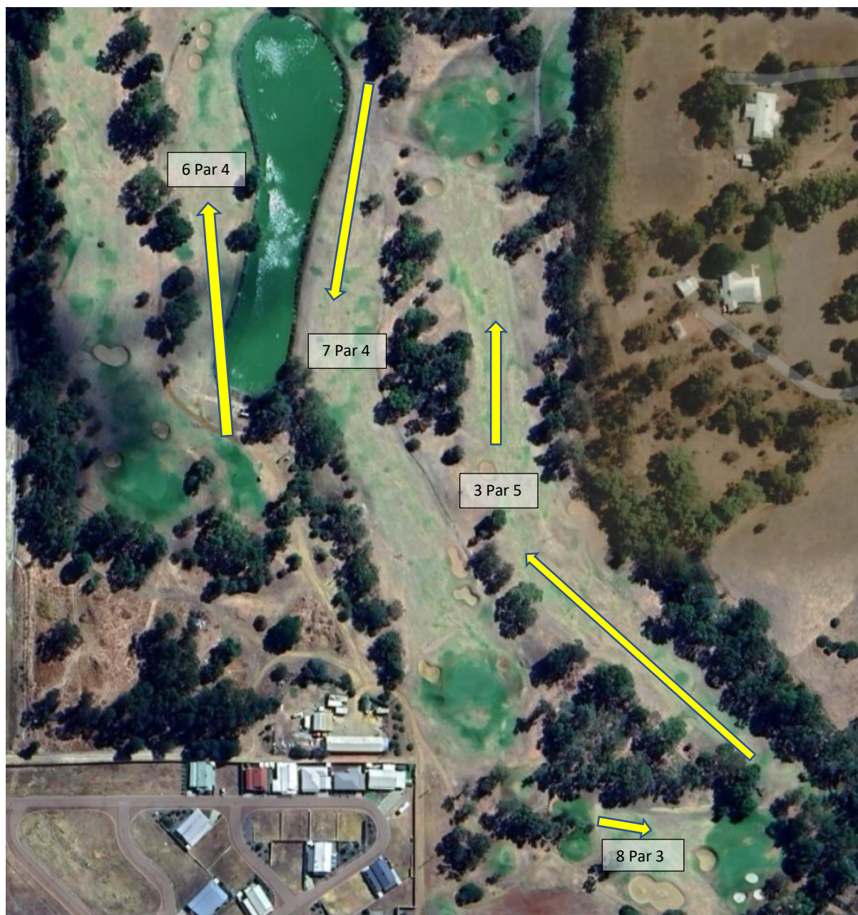
Hole 3 and some return holes 6, 7 & 8

Hole 3 Par 5 (448 Metres) Index 13 A dogleg right , if you want to be on in 2 you need a long tee shot cutting close to the corner, a raised fairway makes it hard get on with a long iron. The green is wide but shallow, hard to stay on the left side but mounds from the bunkers back and front on the right side make for a better landing.